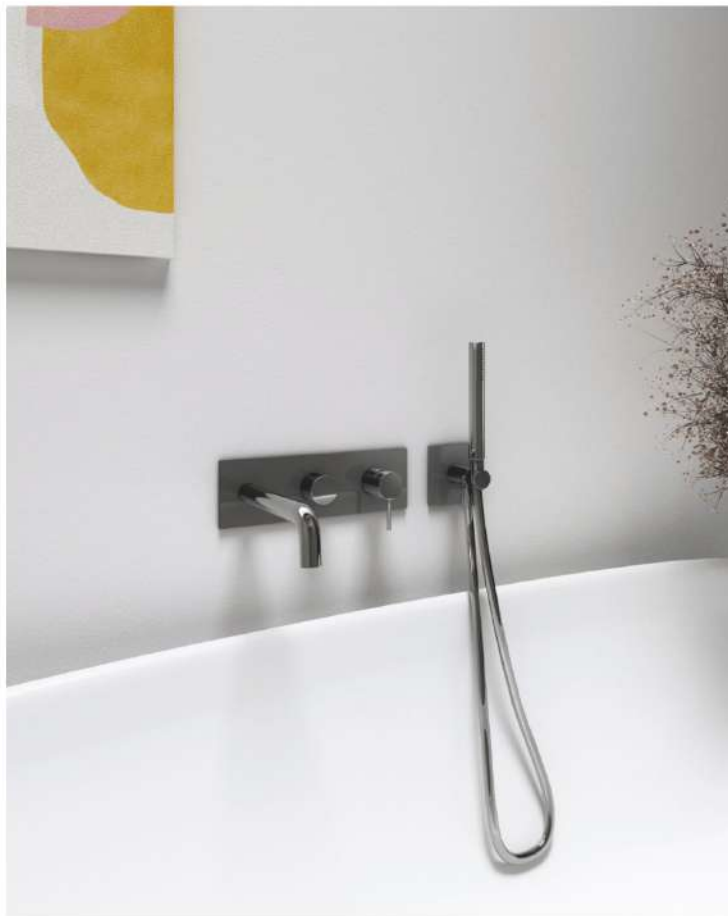
Phi series by CRISTINA Design Lab

Three new stainless steel kitchen mixers redefine kitchen design – minimal, durable, and sustainable. Available in brushed steel or matte black, they add a refined touch to any space. Designed for ergonomic efficiency and seamless flow control, they merge aesthetics with high performance, shaping the kitchen's atmosphere with lasting quality and conscious design.