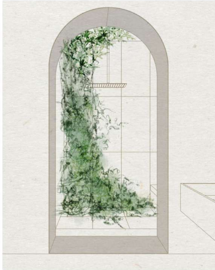
Sketch for Neda, installation by Elisa Ossino Studio for CRISTINA Rubinetterie

"I would like to invite all the guests of the showroom to pleasantly indulge in an experience of strong connection with nature, multi-sensory and synesthetic, contemplating the value of reconnecting with a dimension of pure harmony," said the designer.