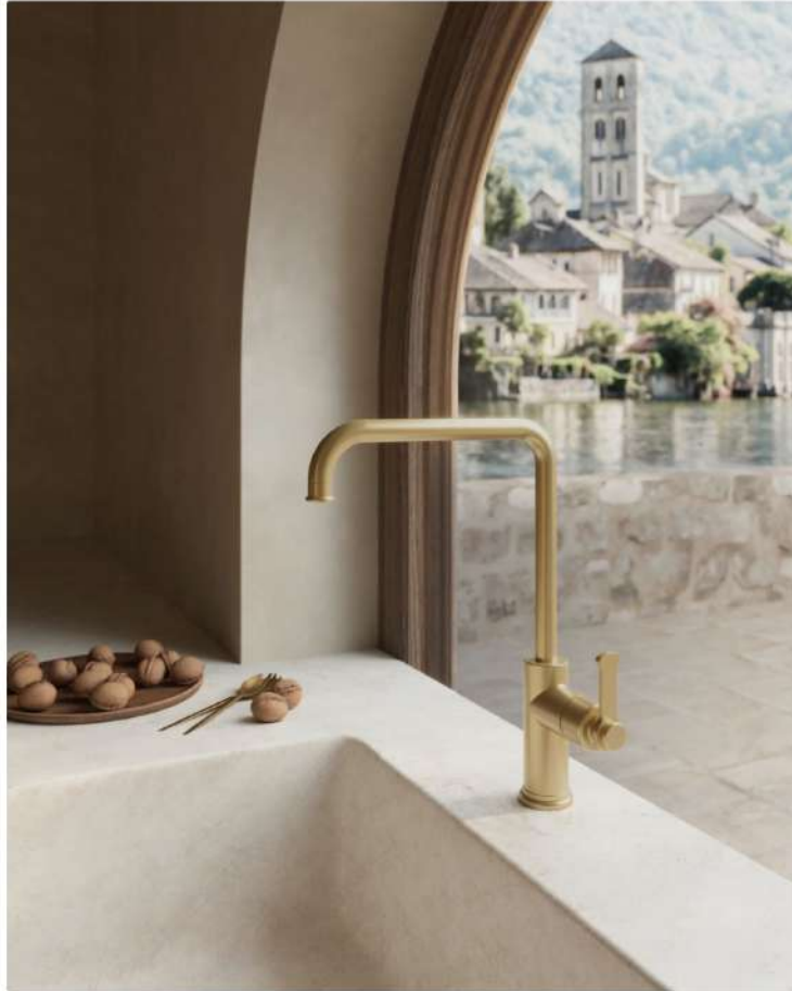
Faro series, kitchen mixer by CRISTINA Design Lab

and contemporary, its small, compact body offers strong personality, blending elegance with innovation. More than a faucet, it is a protagonist, balancing beauty, function, and sustainability.