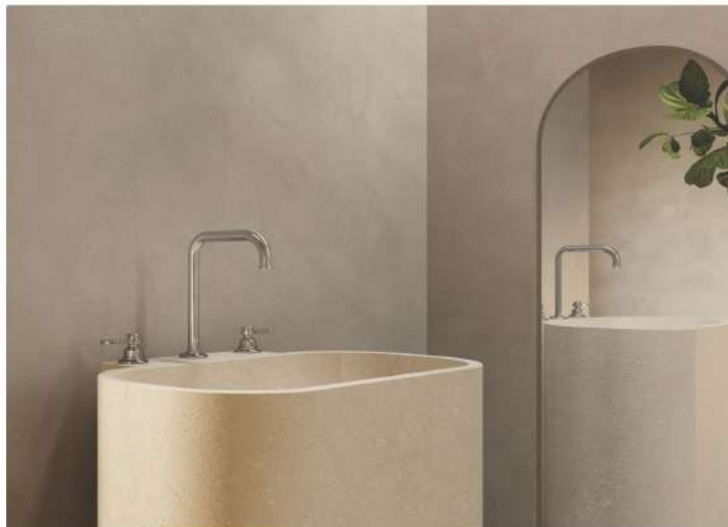
Faro series by CRISTINA Design Lab – © CRISTINA Rubinetterie

Botte by angelettiruzza design is pure balance: a fusion of aesthetics and function that transforms essentiality into poetry. Inspired by nature, its fluid form evokes water droplets and sculpted dunes, with a spout that is a technical masterpiece ensuring seamless integration. More than just a faucet, Botte shapes the bathroom into a space of serenity and self-discovery. A blend of tradition and modernity, it embodies a timeless design with a future-oriented perspective.