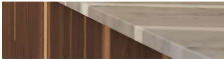
New Kitchen Mixer by CRISTINA Design Lab

The company also expands its kitchen line with filtered mixers for cleaner, better-tasting water. A dual-lever system ensures separation between filtered and mains water, preserving purity. Two versions are available: CRIKT460, featuring an activated carbon filter to reduce chlorine and impurities, and CRIKT462, designed for compatibility with existing filtration systems. Chrome and metallic finishes offer customization, while the sleek, intuitive design embodies CRISTINA's Made in Italy craftsmanship.