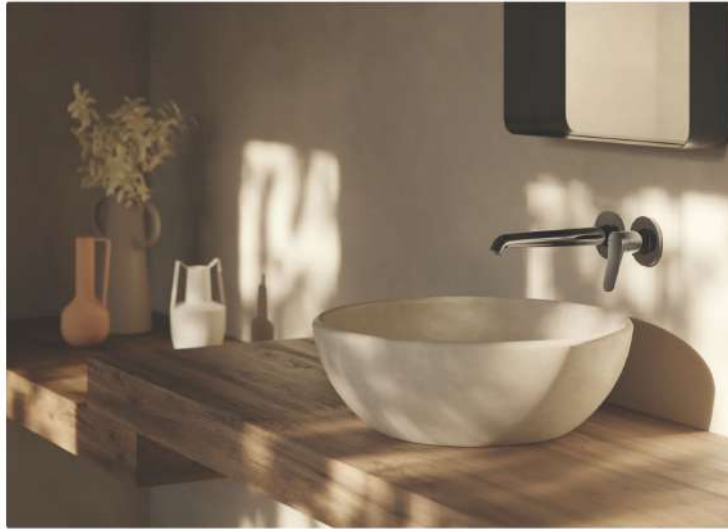
Botte series by angelettiruzza design – © CRISTINA Rubinetterie

The brand's core values have always been a commitment to aesthetics and innovation. But from now on, these values evolve into a new chapter – where spaces are not merely furnished but conceived as environments that nourish both body and mind. Products are no longer seen as isolated functional elements but as symbols: of balance – between functionality and well-being; of harmony – where nature is respected, and its rhythms are embraced as an added value; of experience – where the senses are preserved, allowing us to engage with spaces in a profoundly different way. The new collections, set to debut at Salone del Mobile 2025, embody this renewed spirit and forward-thinking vision.